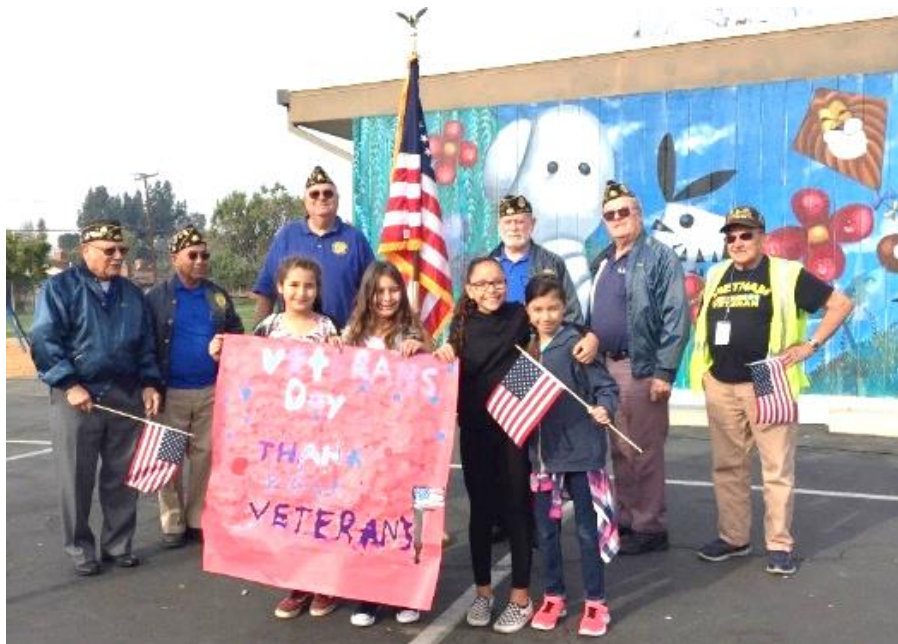
Post 51 members and other veterans at Ceres Elementary 11/9/2017.