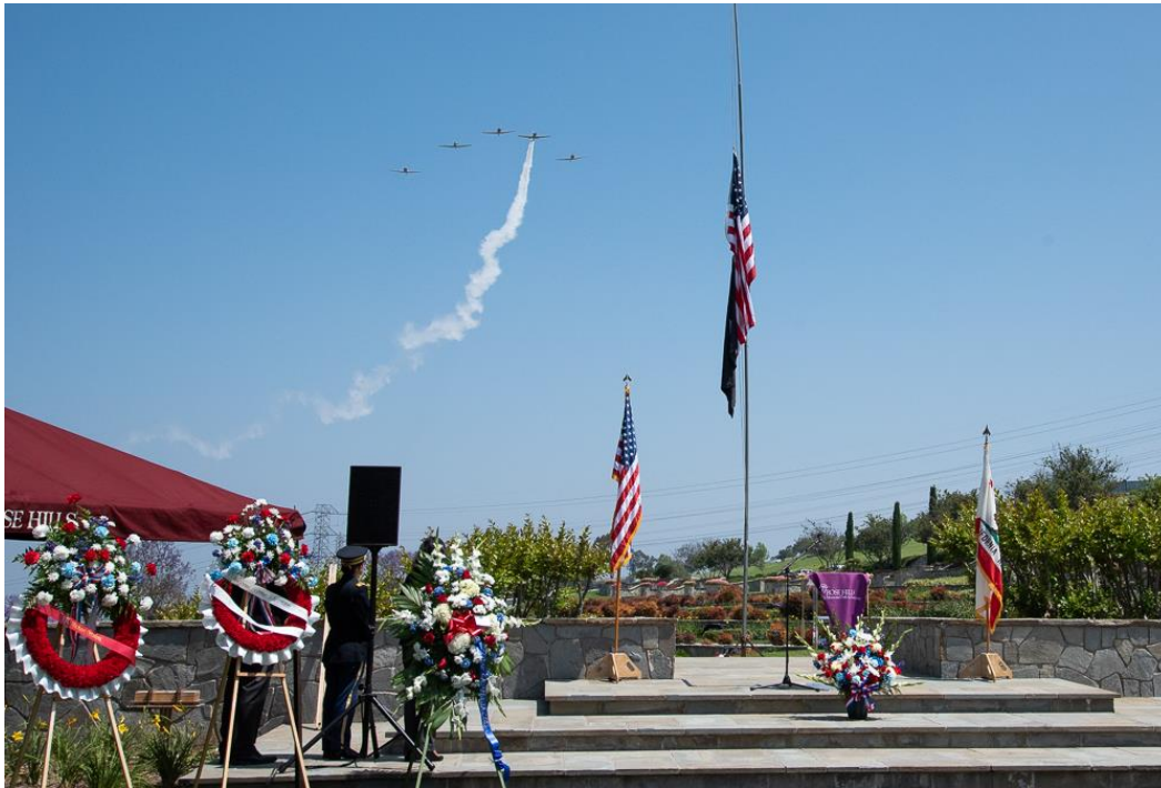
Post 51 Memorial Day at Rose Hills Memorial Park 5/28/2018. Flyover of WWII Vintage Aircraft.