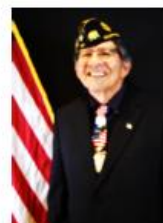
AL GRAMADOS CHAPLAIN