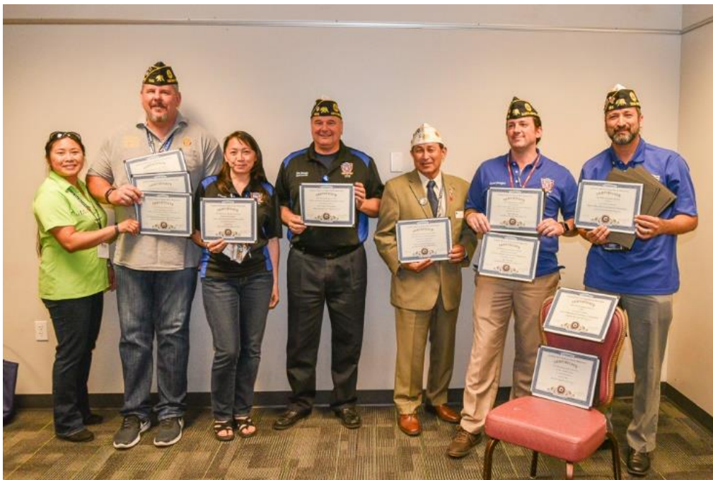
100 th Dept of Calif. Convention 6/22/2018. The CALPA Awardees for 2017-2018.