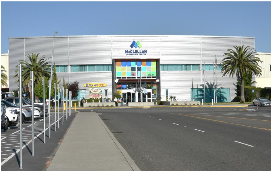
100 th Dept of Calif. Convention 6/22/2018. McClellan Conference Center, Sacramento, CA 6/21/2018.