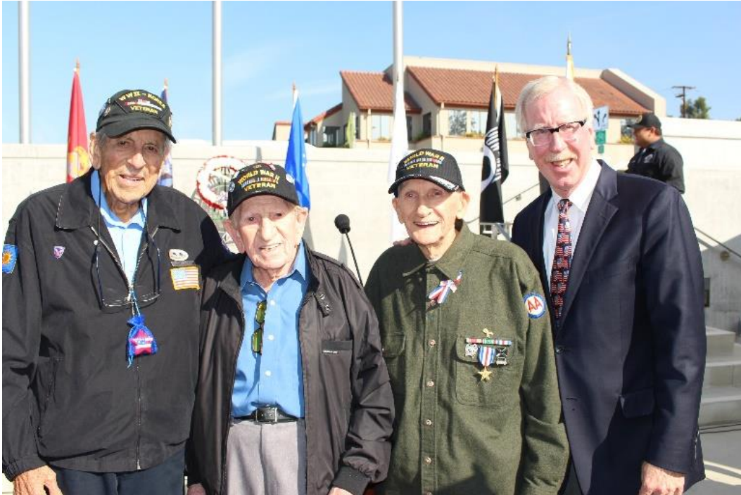
Veteran's Day Whittier City Hall 12/10/2017. Local WWII Veterans with City of Whittier Mayor Joe Vinatieri.