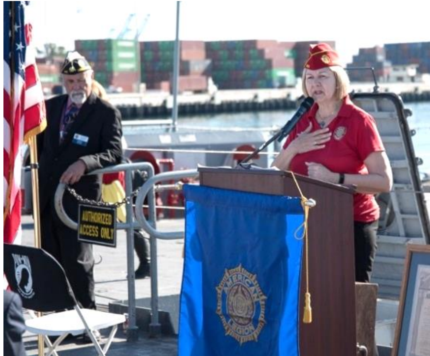
National Commander in Historic Visit to USS IOWA BB-61, 12/12/2017. Commander Rohan speaks to IOWA attendees.