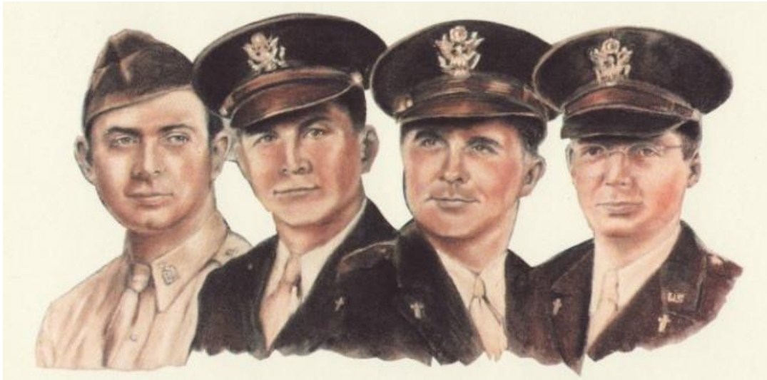
The Four Chaplains

Four Chaplains Ceremony 2/6/2018. L/R Alexander D. Goode, George L. Fox, Clark V Poling, and John P. Washington.