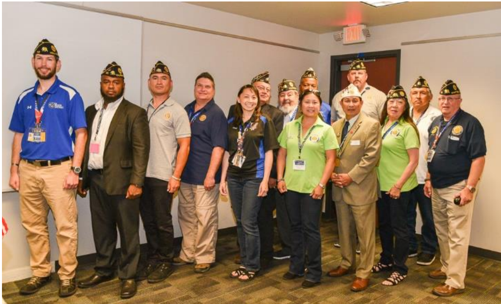
100 th Dept of Calif. Convention 6/22/2018. The newly elected CALPA officers for 2018-2019.