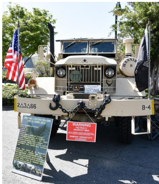
Uptown Whittier Car Show 6/2/2018. Nothing says car show like a 5 ton, 6x6 restored M818 Tractor Truck