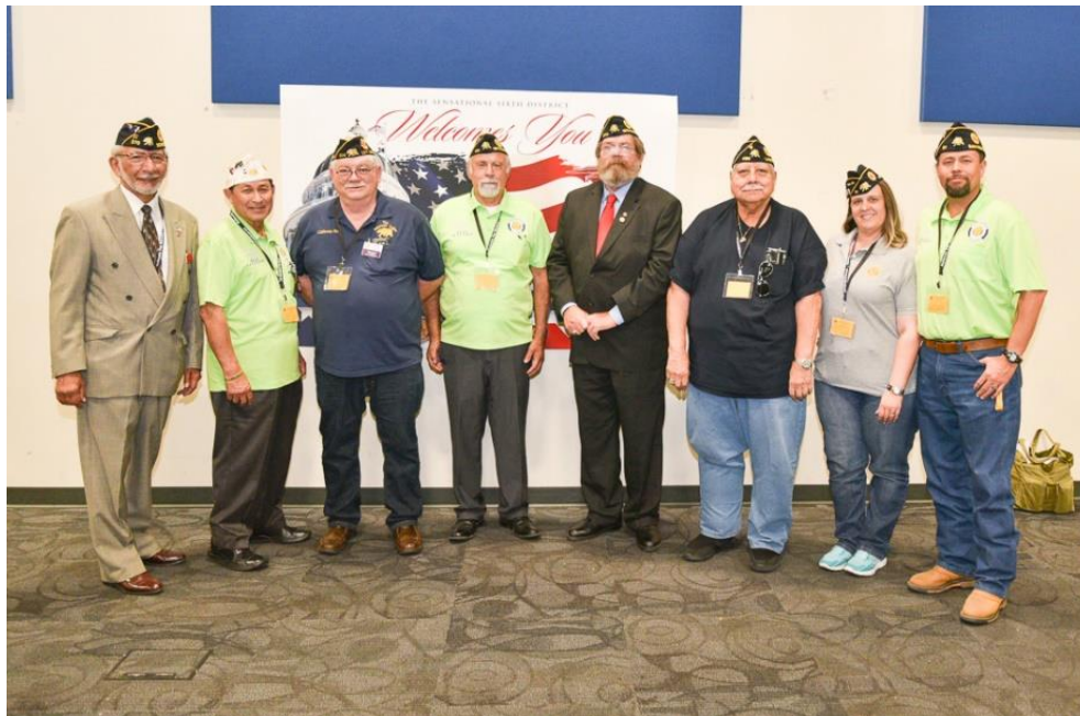
100 th Dept of Calif. Convention 6/22/2018. The District 19 Delegates.