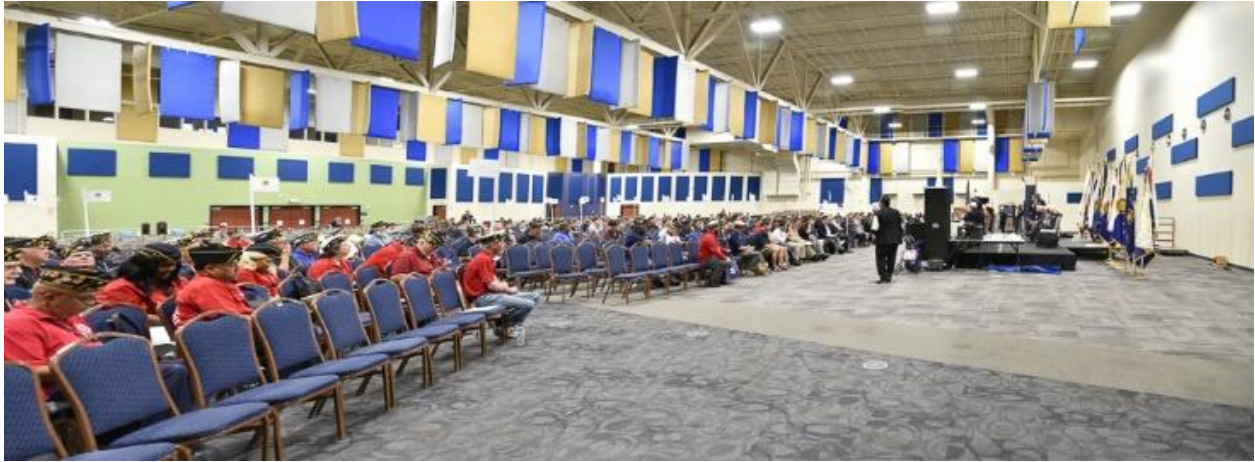
100 th Dept of Calif. Convention 6/22/2018. View of the Convention Floor.