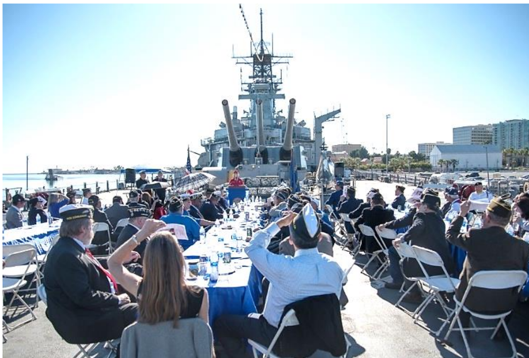
National Commander in Historic Visit to USS IOWA BB-61, 12/12/2017. Commander Rohan addressing attendees