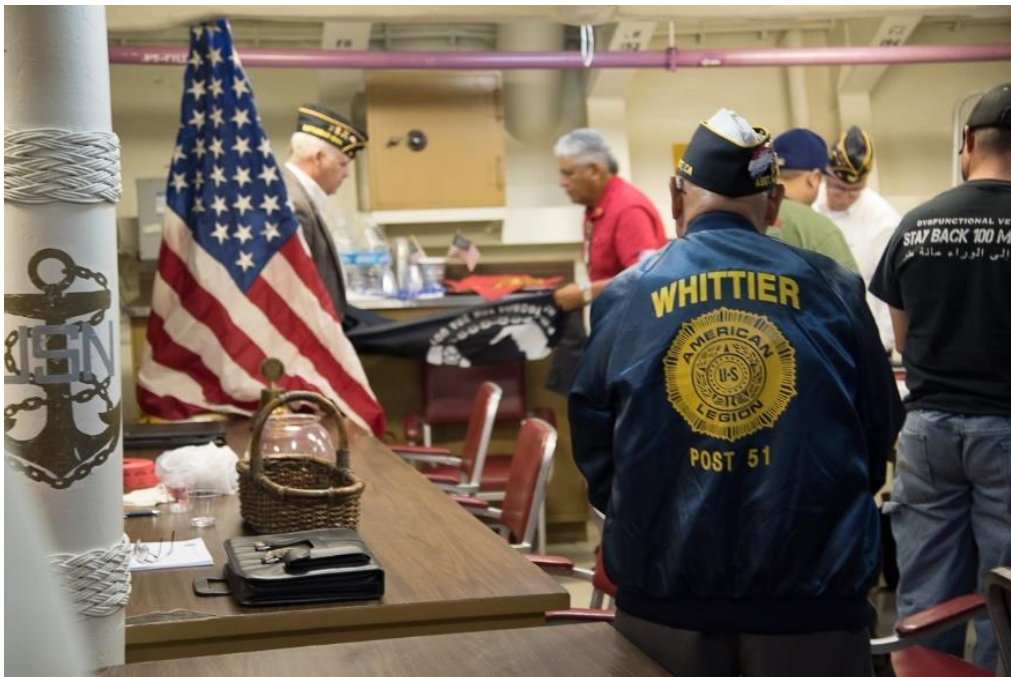
Battleship IOWA Post 61 Inaugural Meeting 11/9/2018. Opening ceremony with placement of POW/MIA flag. Post 51 attended.