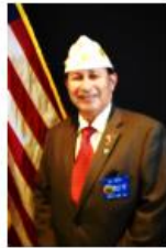
GILSOTO AREA 4 VICE COMMANDER