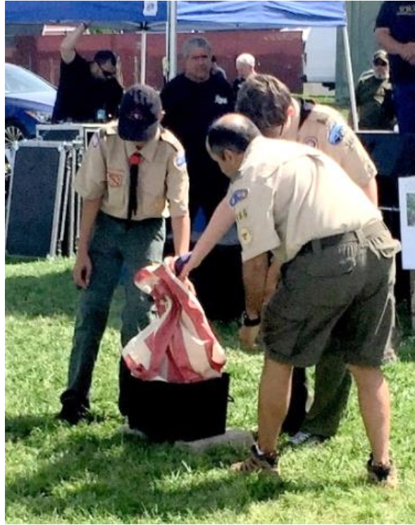
WHVVD Event Sierra High School. Boy Scouts retire a US Flag