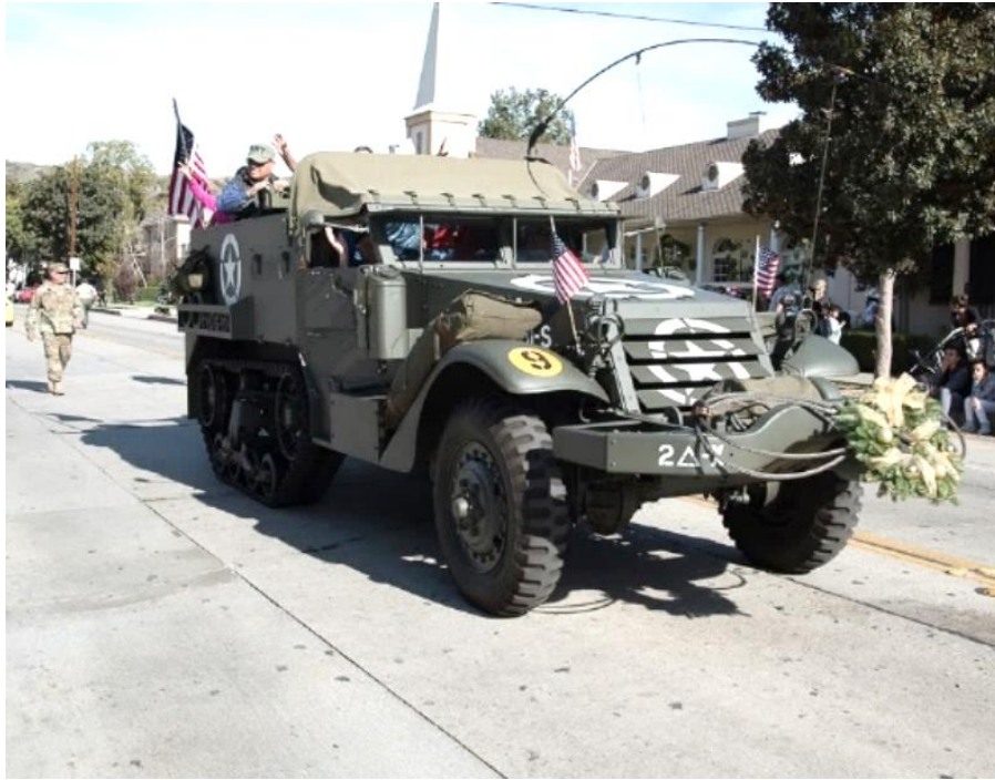
Whittier Uptown Association Christmas Parade 12/9/2017. Nothing Says Christmas, like a Half Track.