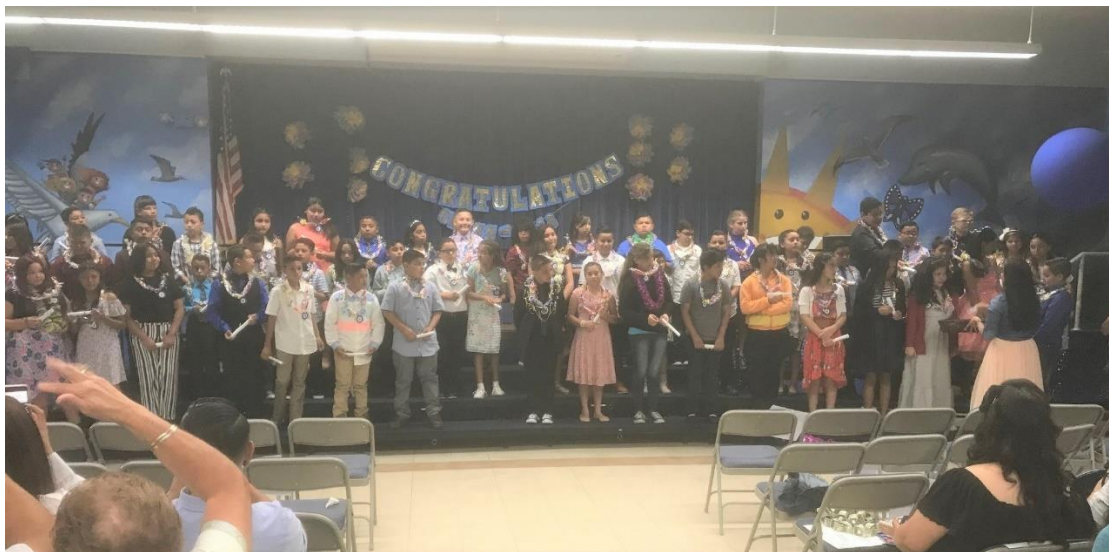
Ceres Elementary School Graduation Ceremony, June 6 2017.