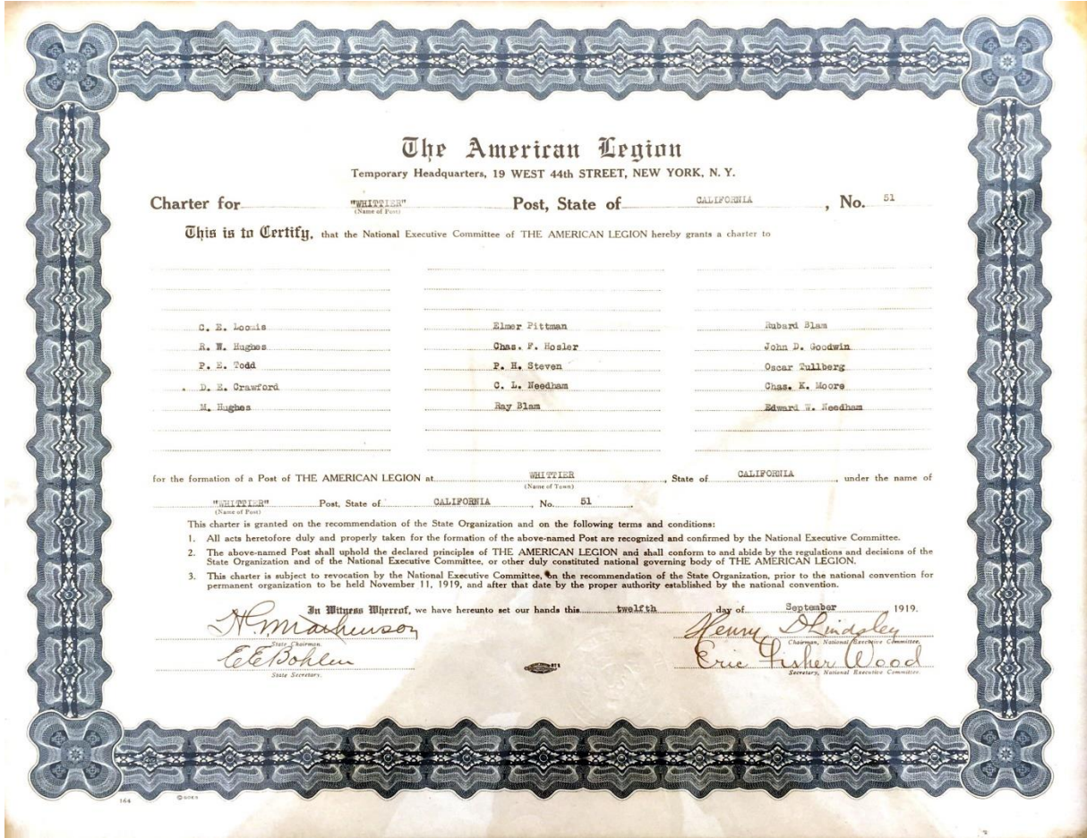
Original Temporary Charter for Whittier Post 51, dated September 12, 1919.