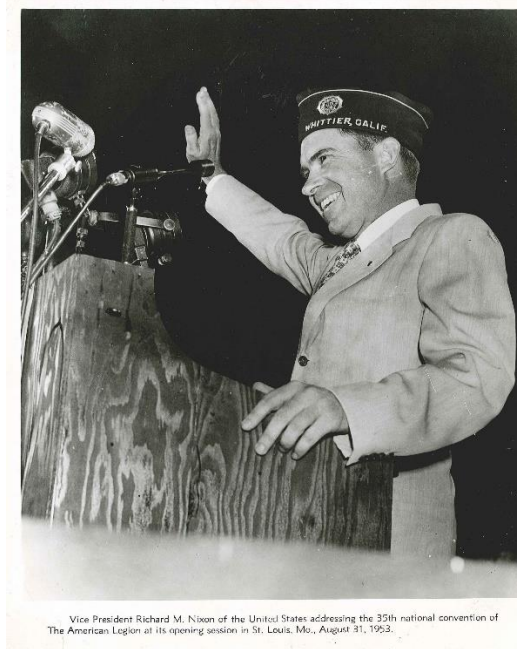
Vice President Richard M. Nixon of the United States addressing the 35th national convention of The American Legion at its opening session in St. Louis, Mo., August 31, 1963.

Richard M. Nixon (January 9, 1913 – April 22, 1994) who served as the 37th President of the United States, from 1969 until 1974. During his first year in office, then President Nixon received the American Legion's Distinguished Service Medal in 1969. He was a WWII veteran serving in the U.S. Navy from 1942 to 1946. He was also a PAID-UP-FOR-LIFE (PUFL) member of Whittier Post 51.