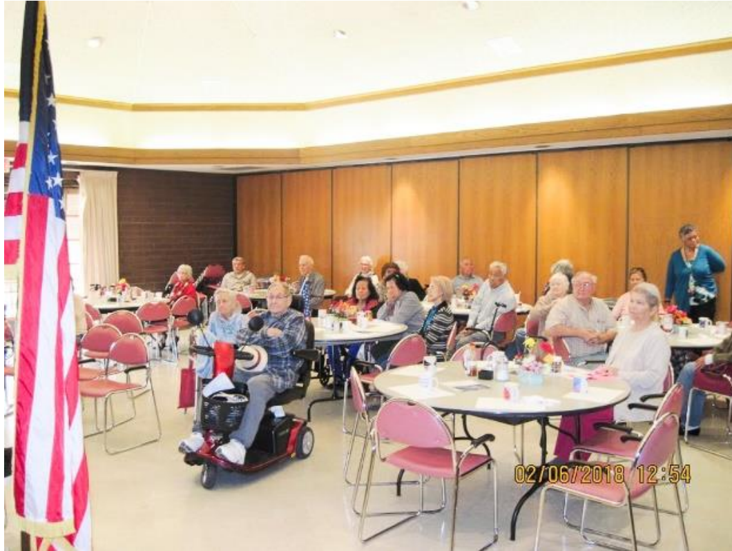
Four Chaplains Ceremony 2/6/2018. Members of the public listening to Four Chaplains lecture.